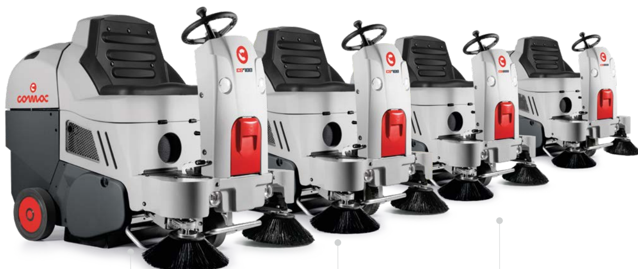
CS700 B Battery version