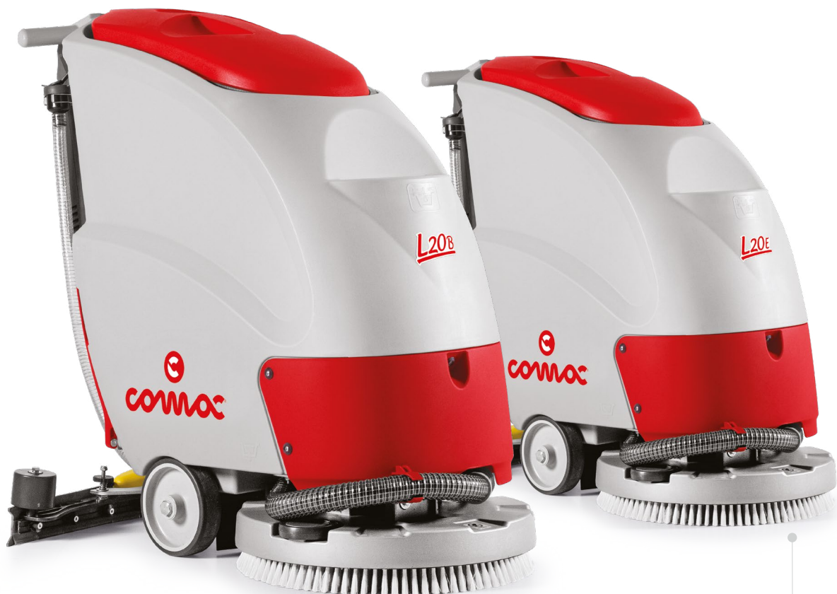
L20 B Battery version with disc brush