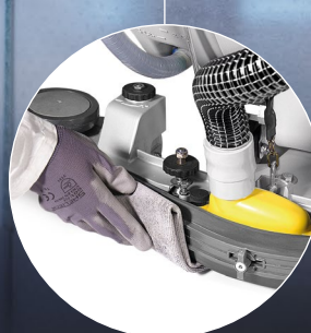
To ensure a perfect drying, the suction hose and the squeegee rubber blades must be cleaned at the end of any cleaning operation. The squeegee can be lifted to quickly clean the rubber blades.