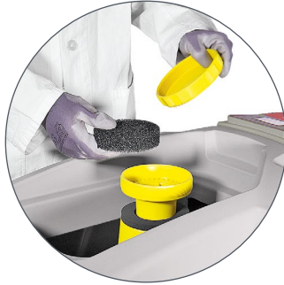
For an effective vacuuming the suction filter must be kept clean.