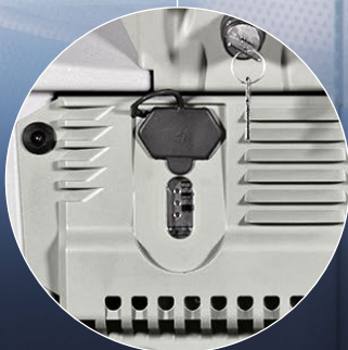
The on board battery charger makes recharging easier and quicker.