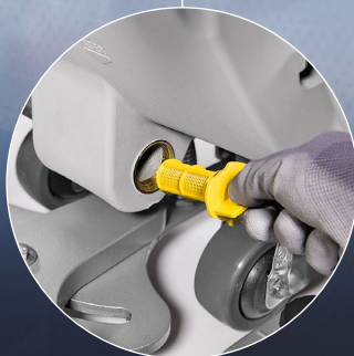
Solution filter cleaning.