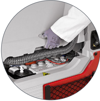
Full access to components makes easier both regular and extraordinary maintenance.

For this reason, the parts requiring daily maintenance are distinguished by their yellow color. In this way, the operator can easily identify the parts to be sanitized at the end of the shift.