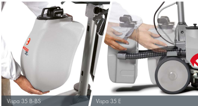
Vispa 35 B-BS

Thanks to the combined action of the suction motor and the squeegee swinging around the brush, perfect drying is ensured also on bends.