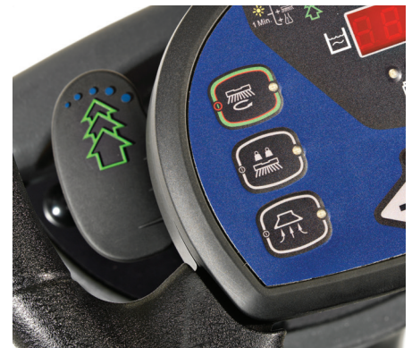
One paddle activates & de-activates the Ecoflex system