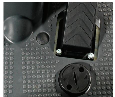
Fully adjustable traction pedal can be aligned with the operators choice of driving position