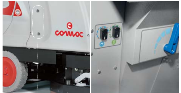
Liquid level indicators (version with CDS)

The dashboard is easy to read and within easy reach of the operator to allow total control of every working phase. The electronic system - accessible through a lift-up panel from the front - controls every scrubbing phase. Thanks to the self-test system every anomaly can be identified so that technical service times are considerably reduced